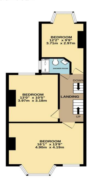
2ND FLOOR 325 sq.ft. (30.2 sq.m.) approx.

1ST FLOOR 499 sq.ft. (46.4 sq.m.) approx.